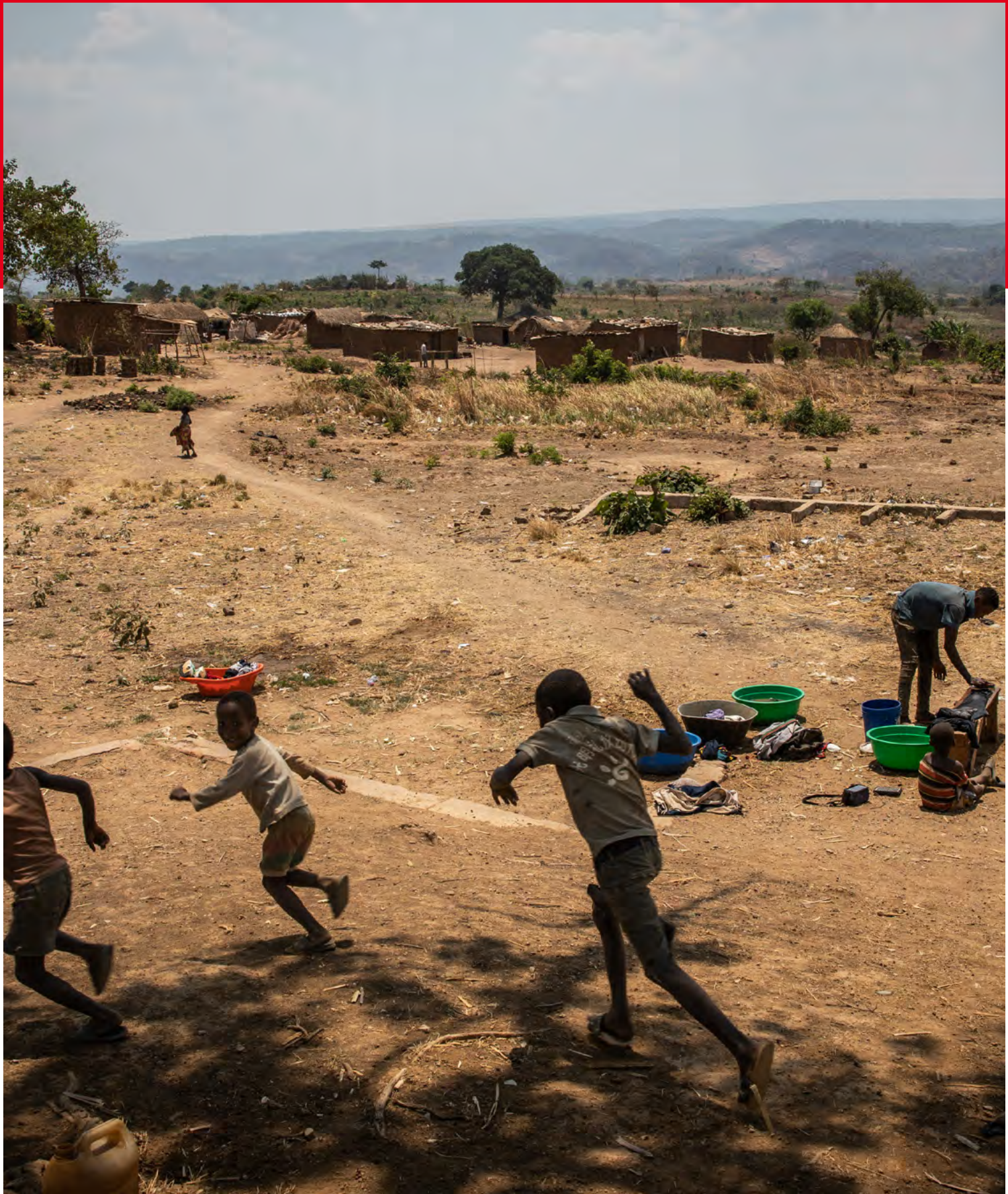
Children playing in the town of Kolwezi.