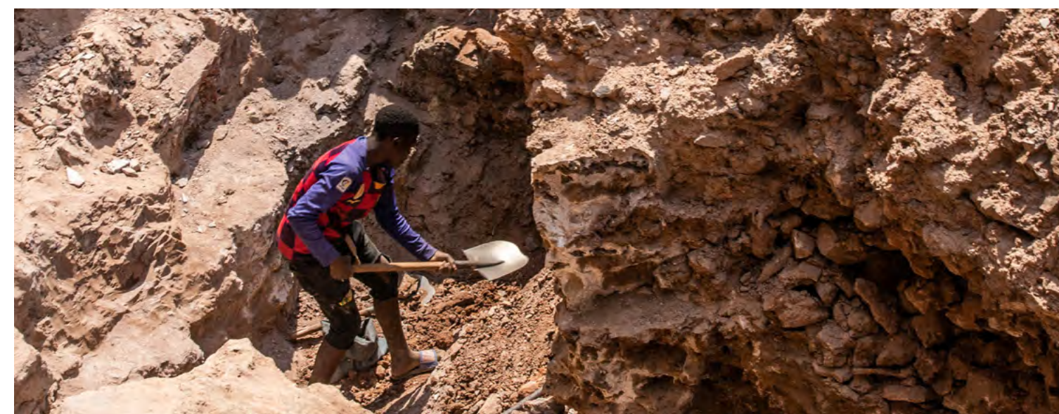
Children in an ASM site in Kolwezi.