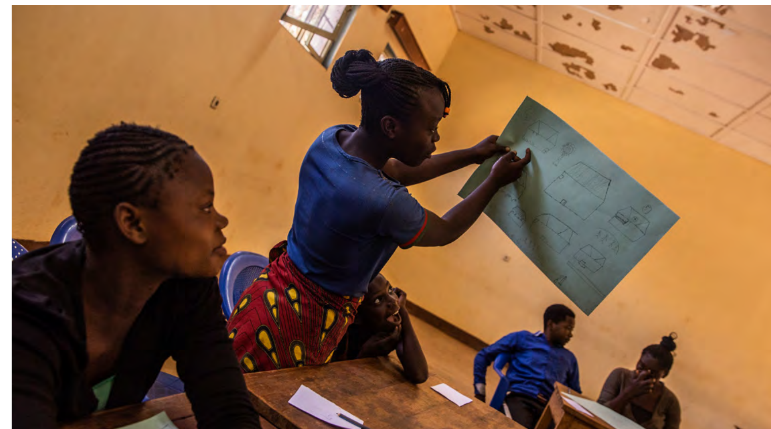
Children take part in a focus group carried out on behalf of Save the Children, intended to understand the scale and scope of child’s rights violations in mining communities.