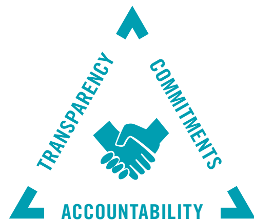
The accountability triangle, adapted from Oxfam.

The Equator Principles are a risk management framework, created and adopted by financial institutions, for determining, assessing and managing environmental and social risks in financing projects. Currently, 118 Equator Principles Financial Institutions (EPFIs) in 37 countries worldwide have officially adopted the EPs, covering over 70 percent of international Project Finance debt in emerging markets. Since their introduction in 2003, the Principles have become the de facto standard for all banks and investors on how to deal with potential and environmental effects of large-scale projects to be financed. The most recent version of the EPs is EP4, which was agreed upon in November 2019 and came into effect on 1st October 2020. BankTrack has called for greater accountability under the EPs since the start of the initiative. In 2019 BankTrack joined a call from 79 civil society organisations and partners for the Equator Principles to develop a central accountability mechanism, and “were disappointed that the EPA did not take the opportunity to announce the development of such a mechanism as part of EP4”. 53