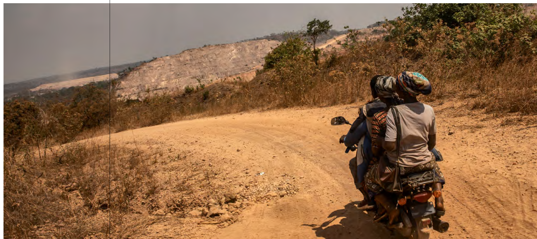
Women travel past the Tenke Fungurume mining site, Kolwezi.

Financial institutions should play a more active role in multi-stakeholder initiatives to assess the human rights risks more proactively, better monitor on-the-ground impacts, better educate themselves on solutions to address the most salient human rights and child rights issues in affected communities, and consequently, to have a more informed and effective engagement dialogue with their clients/investees to address those issues.