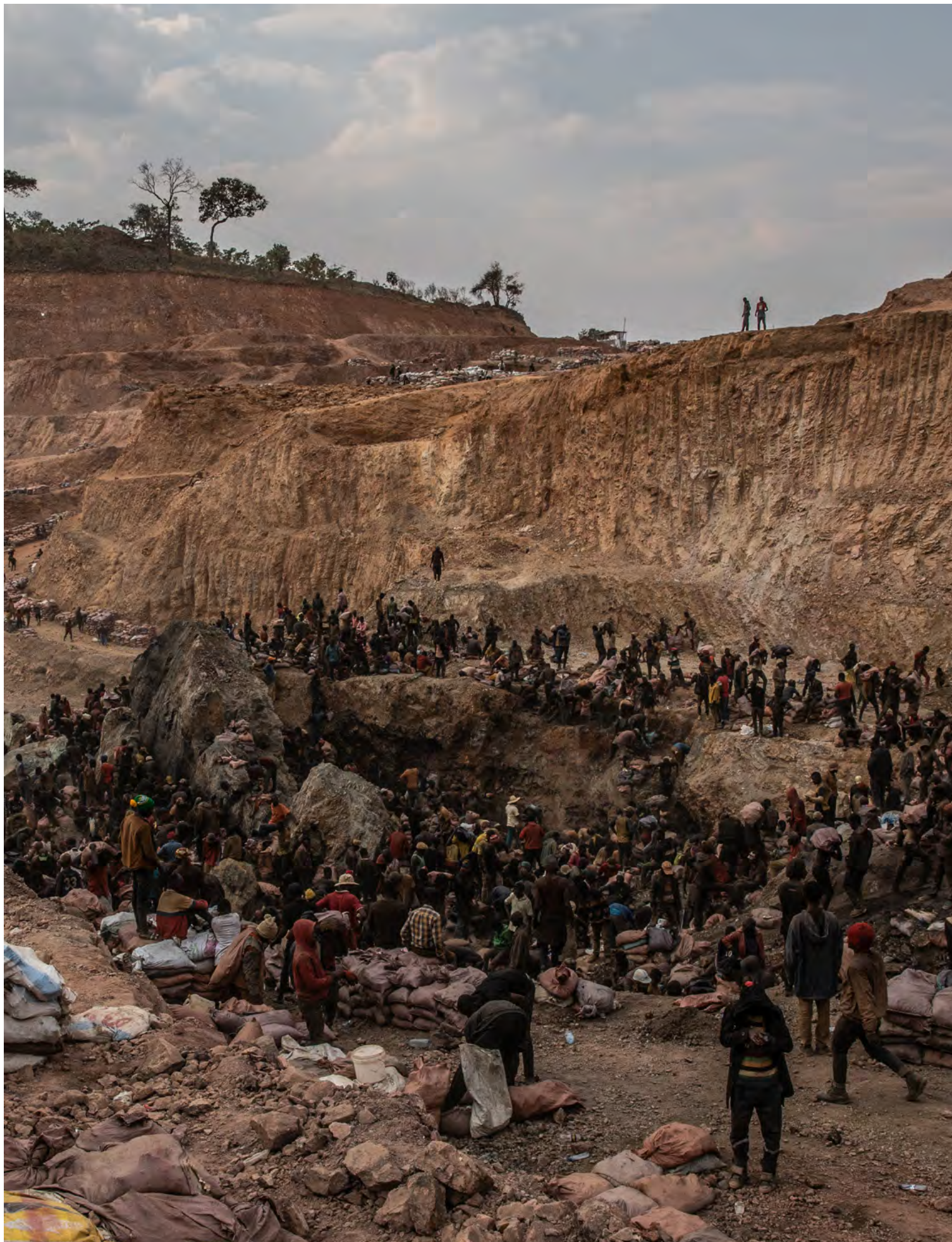
View of an illegal cobalt mining site, Kawama, Kolwezi.