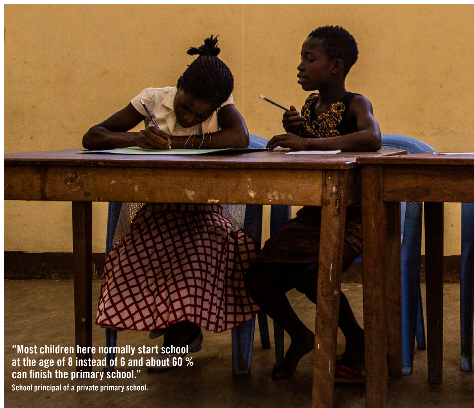
School children work on an exercise.

“Most children here normally start school at the age of 8 instead of 6 and about 60 % can finish the primary school.”