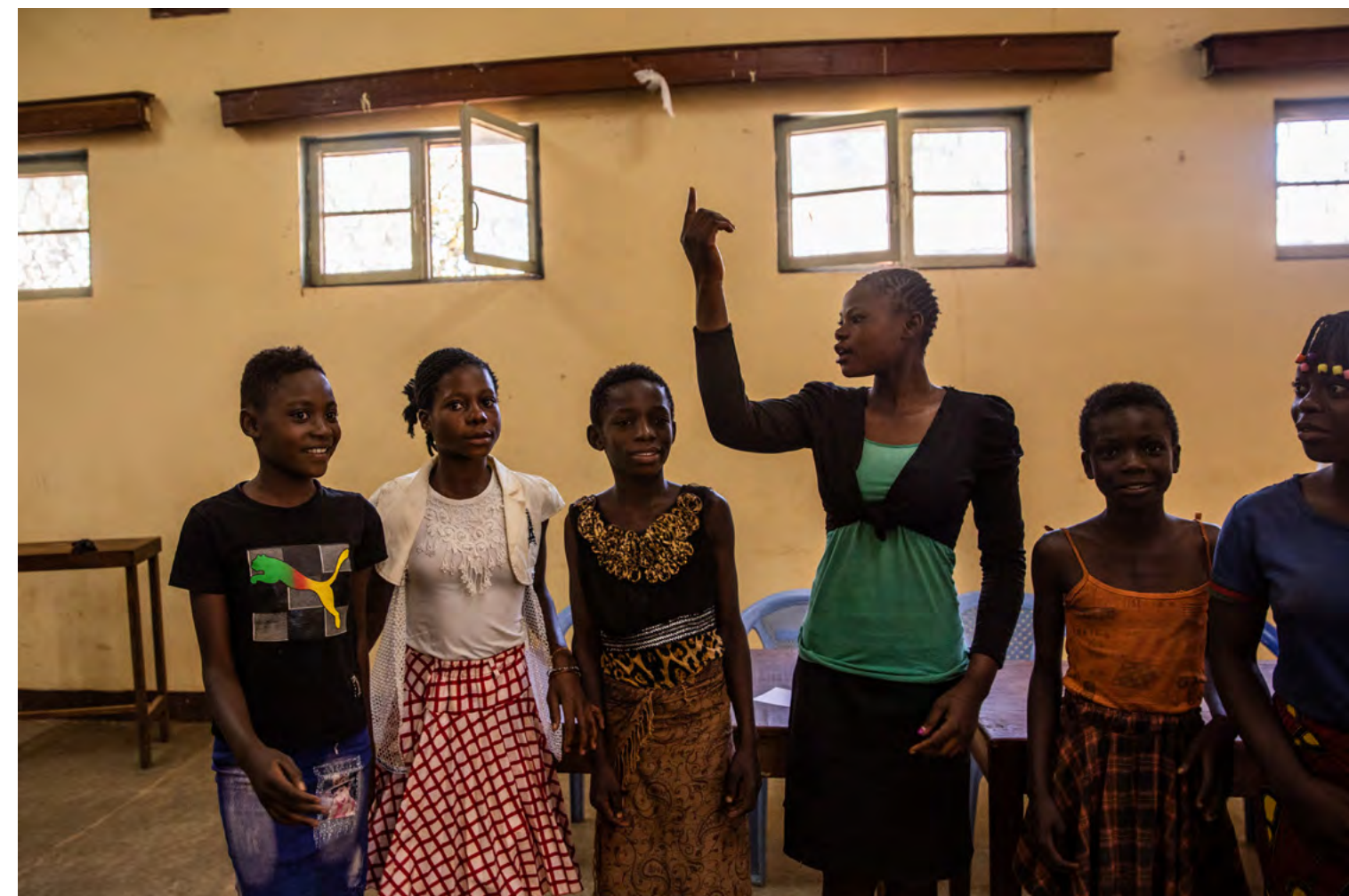
Children present their collaborative work in front of a group in a focus group activity organised as part of the study.