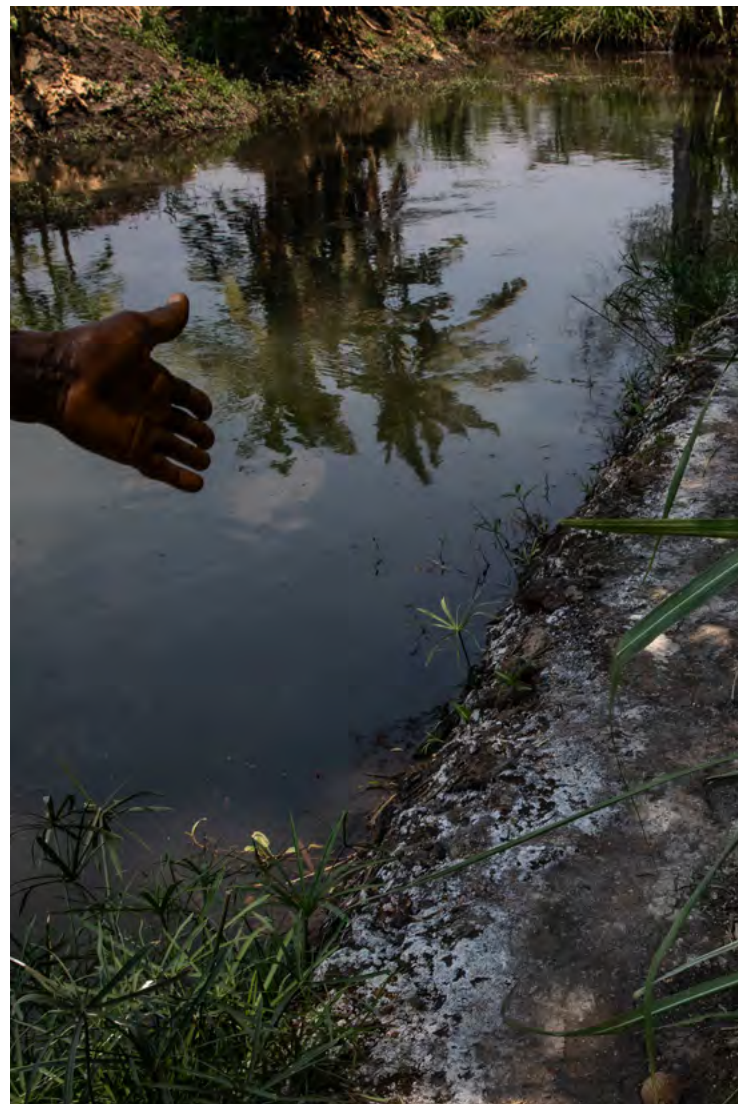
White residue appears on soil in Mulumbu village, where communities complain of environmental devastation as a result of proximity to the Tenke Fungurume mine (perception of communities).