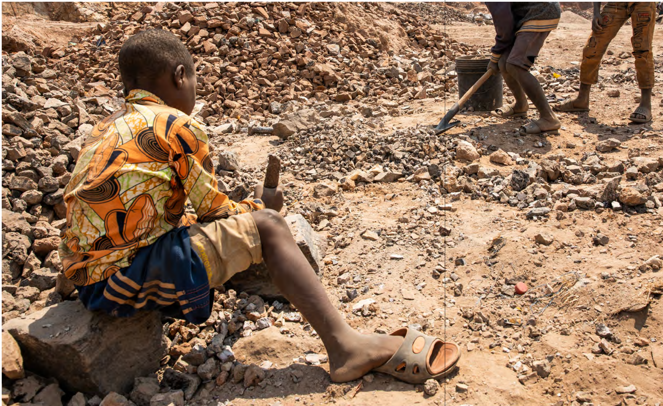
Children work in an ASM site, Kolwezi.