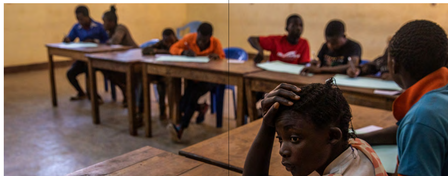
Children participate in the focus group.

Cobalt is not classified as a conflict mineral in legislation like the U.S. Dodd-Frank Act, and therefore any regulations aimed at curbing the illegal flow of conflict minerals does not apply to cobalt. The EU's new Conflict Minerals Regulation 28 that came in effect as of 1 January 2021 mandates due diligence as defined in the OECD Due Diligence Guidance 29 (PRI 2021), but there is no specific mandatory framework for cobalt. All the international standards that are listed in Box 3 apply to cobalt only on a voluntary basis, and as such create a regulatory gap for due diligence in cobalt, making it a choice of companies, and those that invest in them, as to what degree they