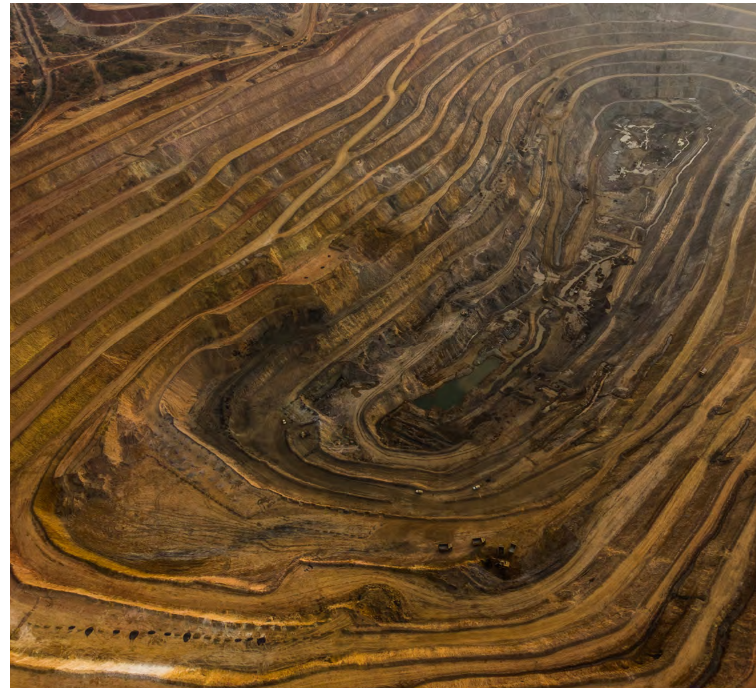
COMMUS copper mine in the midst of the town of Kolwezi.

A recent study by Save the Children found that the education crisis children face in cobalt ASM communities in DRC has been worsening in the past couple of years because of the income shocks to the families following the cobalt price slump and the COVID-19 pandemic. With this trend, the study