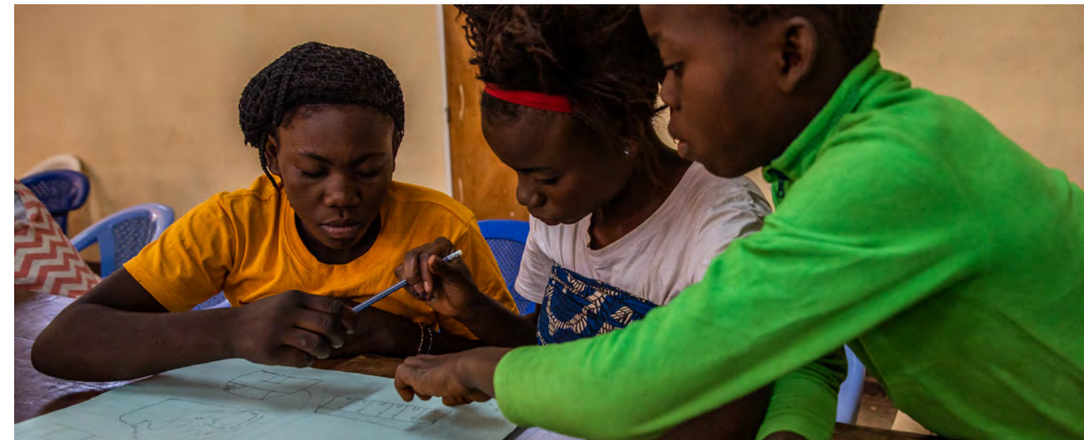
School children work on an exercise during a focus group activity organized as part of the study.

In 2019, the DRC exported USD 1.91 billion in cobalt, making it the second most exported product in DRC after refined copper and unwrought alloys 8 . However despite the significant revenue from cobalt